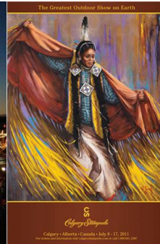
© 2011 Calgary Flames. All rights reserved. The Greatest Outdoor Show on Earth